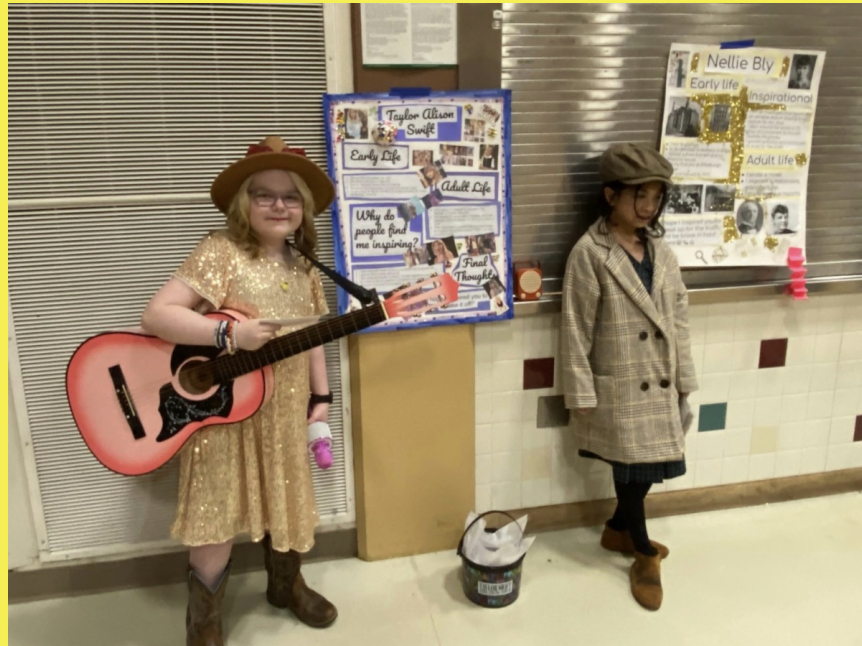
5th Grade Wax Museum!